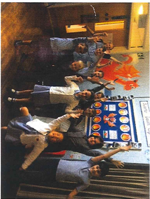
Members of St. Francis Catholic Primary School, Pembrokeshire celebrate achieving the bronze award