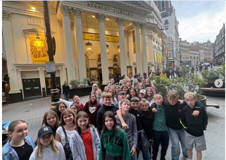
40 Lucky Year 6 pupils visited London this week to take in all the sights. They had an amazing time. Here they are outside the Lyceum Theatre ready to watch the Lion King.