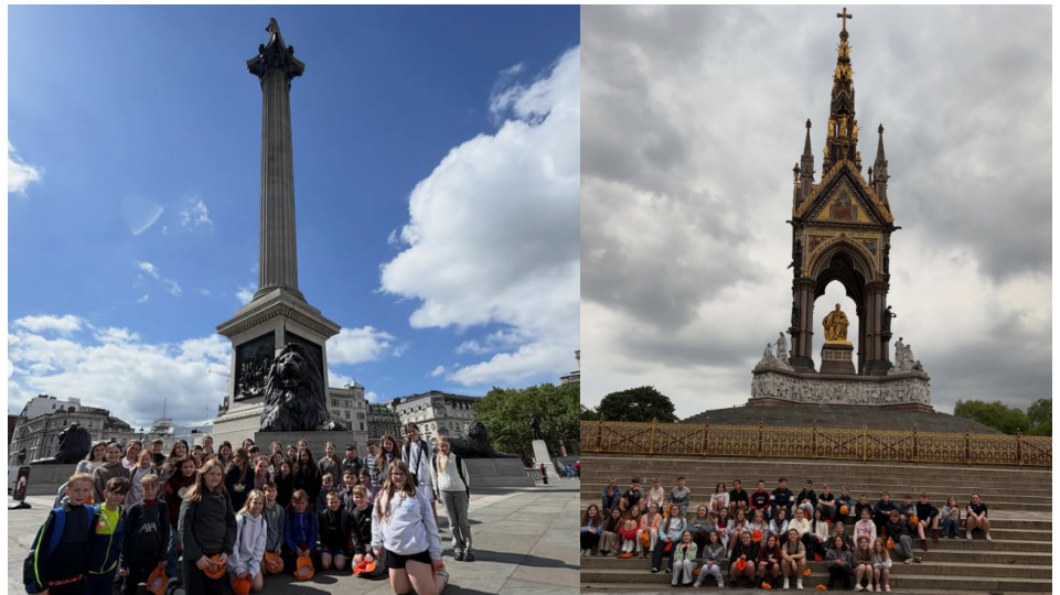
Nelson's column at Trafalgar Square and the Albert Memorial opposite the Royal Albert Hall

It continues to be a very busy time at Ysgol Bryn Coch, with residential trips, visitors and sporting events. Highlights include: